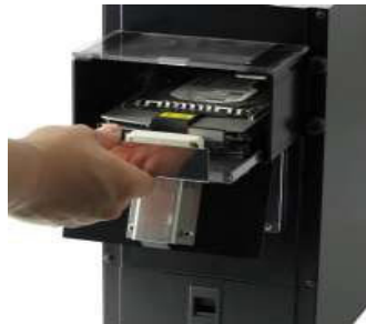
HDD with mounter